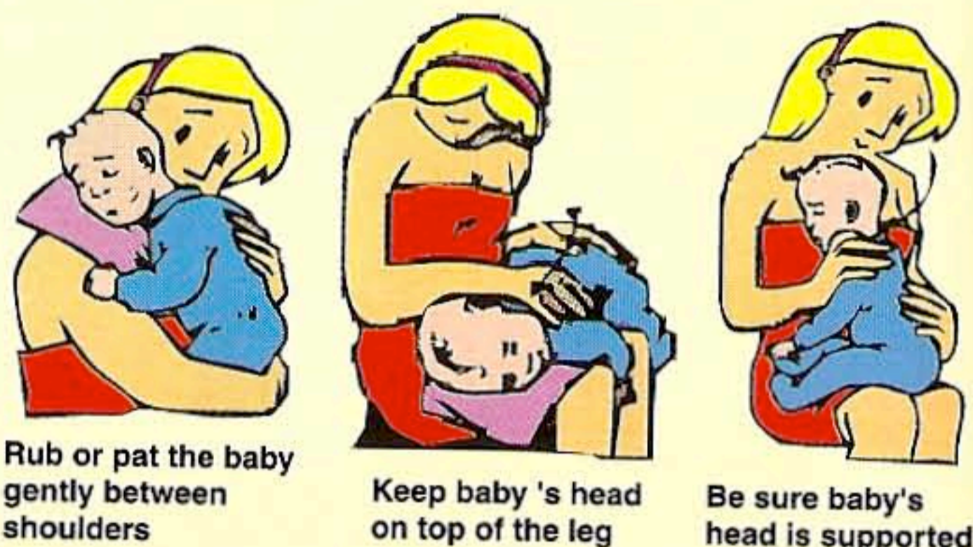
Ways to burp a baby